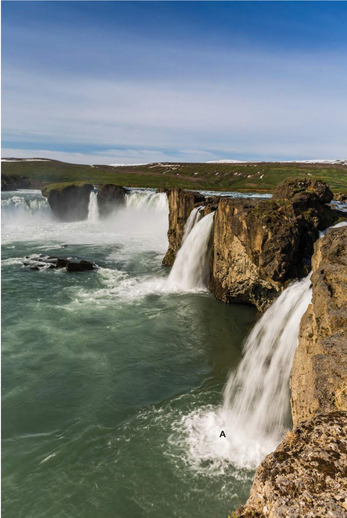
Fig. 1.1 for Question 1